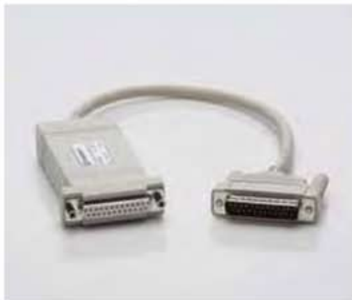
Thermal SmartSensor Adapter

The Thermal SmartSensor Adapter converts LM-model position-sensing thermopiles and LM-2 optical sensors for use with FieldMaxII, FieldMate and EPM2000 meters.